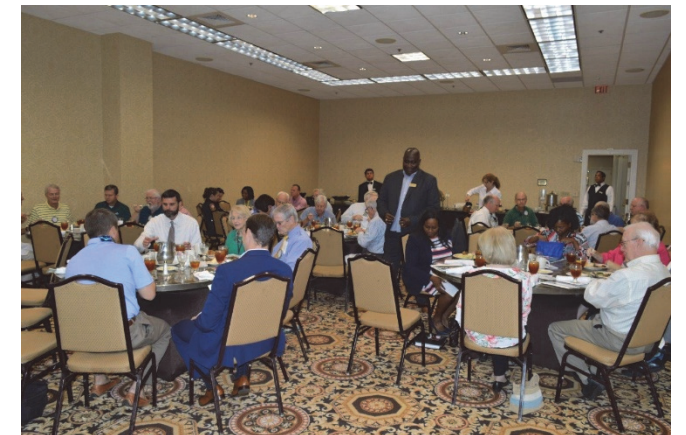
Club Fellowship at Meeting