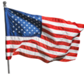
New Member Queen leading pledge and fast-tracking to her blue badge!